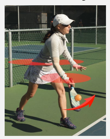
Figure 4-3 (legal serve)