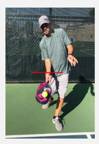
Figure 4-1 (legal serve)