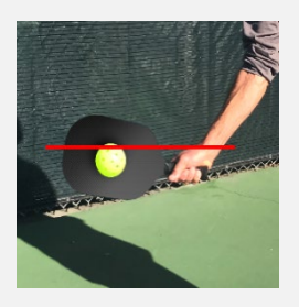
Figure 4-2 (illegal serve)